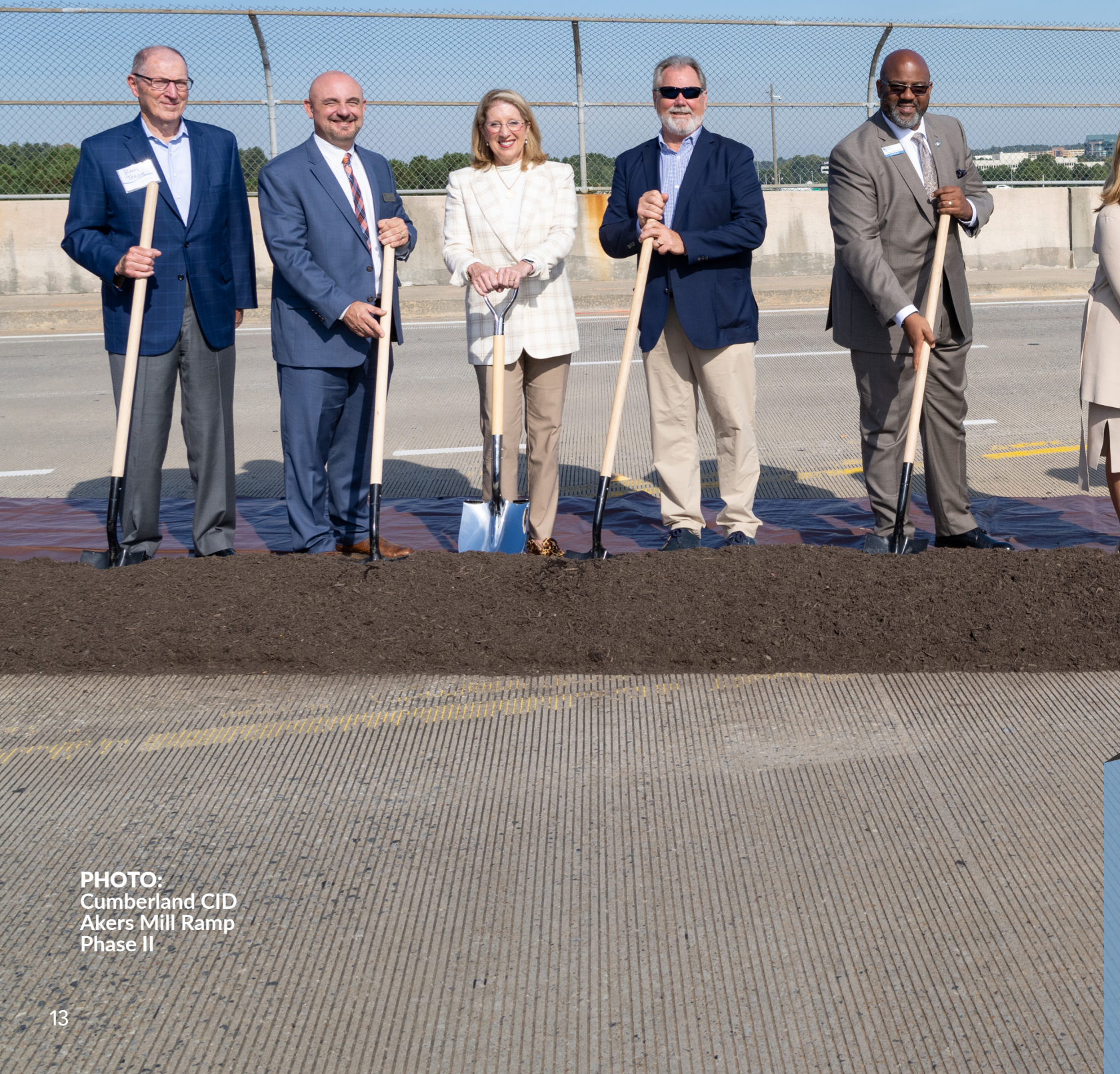
PHOTO: Cumberland CID Akers Mill Ramp Phase II

GTIB funds may be utilized for preliminary engineering, right-of-way and/or construction costs.